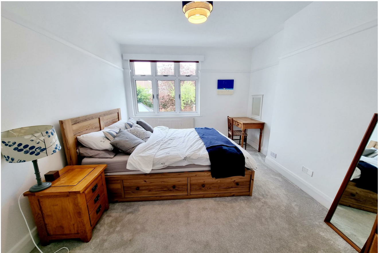
BEDROOM 3: 11'2 x 8'1 (3.40m x 2.46m) Double Glazed Window to Rear, Fitted Carpet, Picture Rail, Radiator.