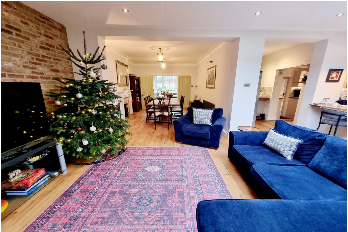
CENTRAL RECEPTION ROOM 2: 17'7 x 11'3 (5.36m x 3.43m) Tiled Feature Fireplace with Wooden Surround and Tiled Inset, Door to Hallway. French Door to Front Reception Room. Wide Opening to Rear Reception Room. Oak Flooring.