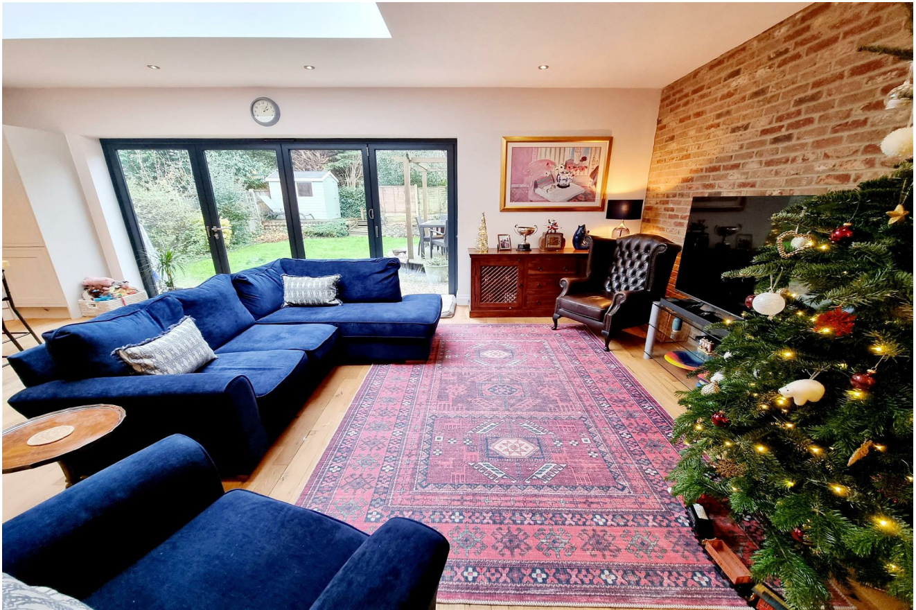
EXTENDED REAR RECEPTION ROOM 1 WITH SKYLIGHT: PIC. Different Aspect Showing Brick Wall Feature and the Skylight.

EXTENDED REAR RECEPTION ROOM 1 WITH SKYLIGHT: PIC. 29' x 26'3 (inclusive) (8.84m x 8.00m (inclusive)) A Feature Brick Wall and Double Glazed Skylight. Open Plan to Luxury Fitted Kitchen/Diner. Bi-Folding Double Glazed Doors to Garden.