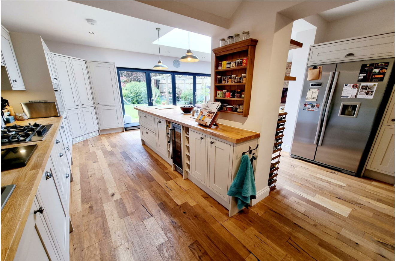
LUXURY FITTED KITCHEN/DINER : PIC 2 Showing the Large Breakfast Bar for 6 People.

Very Spacious and Well Fitted with Ample Floor & Wall Units. 1.5 Inset Sink with Mixer Taps, 5 Ring Gas Ring, Eye Level Double Oven. Integrated Fridge/Freezer, Integrated Dishwasher, Large Breakfast Bar with Units Beneath. French Doors to Garden + Large Double Glazed Window to Side. Large Radiator. Karndean Flooring.